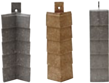
Connectors and caps available in all panel colours.

A complete cladding solution that is flexible enough to cope with different building designs.