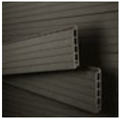
*) Night Sky Black